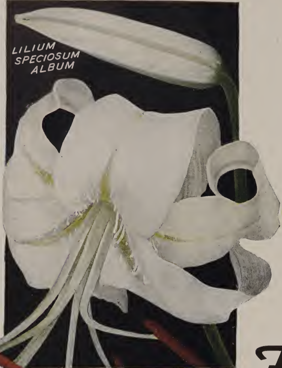
Pure white. August-blooming For description, see page 26